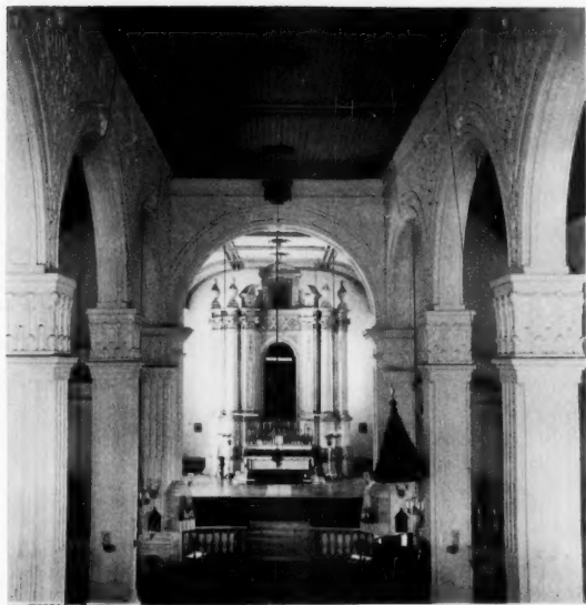
Fig. 3. Interior, with high altar.

known as The Jesus of Passos. 26 The statue is lighted from two small windows on either side and has a low ceiling coinciding with the roof of the apse. It is painted in dark colors, mauve, blue, and brown predominating. There is a noticeable interplay in the ceiling levels of both sections as well as an arched division between the later section of the church and the sanctuary. This arrangement was sound in terms of function because it divided the congregation from the clergy and the altar.