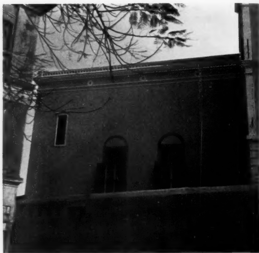
Fig. 5. Northwestern elevation of sanctuary chapel (photo: author 1956).

Two doors are placed symmetrically in the northwest and southeast aisle walls, one being larger than the other (fig. 1). The southeast door originally led to the monastery buildings, but it is rarely used nowadays. The northwest door leads to the administration block, which has a subsidiary entrance. The windows of the nave are small, irregularly set, and have stucco decorations above their arches (fig. 7). They may have been added later for they lack uniformity and are smaller in size than is the case in other Macao churches. There is evidence of the use of a module, for the aisles are approximately half the size of the nave and the height of the columns is exactly twice the width of the aisle.