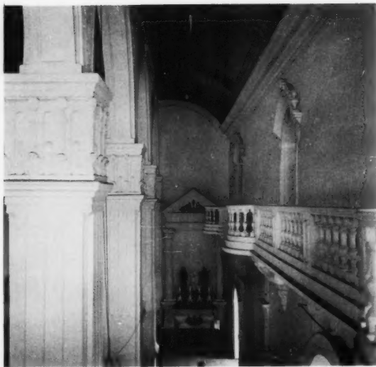
Fig. 4. Southeastern aisle, altar, and part of choir gallery (photo: author 1956).

sive, those used were mainly local. Tiles were employed extensively because they were easily obtained as well as being traditional elements in Portuguese architecture. Walls and beams were larger than were structurally necessary because the builders worked by rule of thumb, and it is interesting to note that the church has always withstood typhoon weather effectively. Local brick and timber were the main structural materials, while surfaces were rendered with a plaster made of lime from sea shells, sand, and molasses. The windows were originally made with small strips of translucent conch shells set in timber frames.