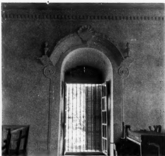
Fig. 7. Window detail, choir gallery.

yellow externally and the decorative motifs, stringcourses, eaves, and window surrounds were picked out in white.