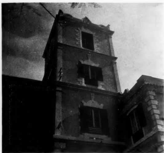
Fig. 6. Belfry, and part of administration block and sanctuary chapel (photo: author 1956).