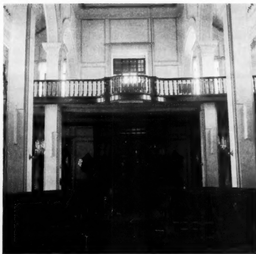
Fig. 8. Choir gallery and rear of nave.

The present church is in fair condition although there are marked signs of white ant infestation in the timber work—particularly in the ceiling. St. Augustine's cannot be seen to its best advantage today because of the encroachment of the outbuildings and adjoining villa garden walls. The church exterior does need complete renovation, repainting, and reconstruction. St. Augustine's