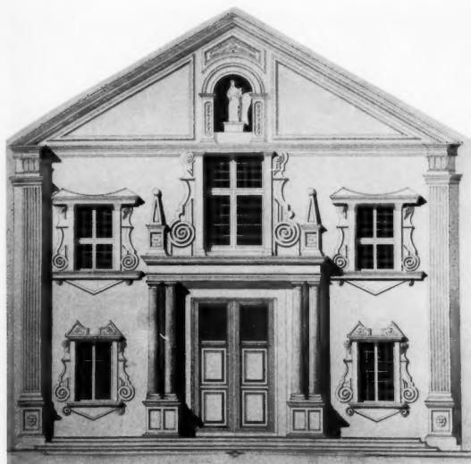
Fig. 2. Drawing of southwestern elevation.